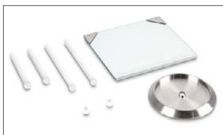
1 The internal draft shield minimises the effect of currents of air in the weighing chamber and therefore significantly improves the stabilisation time and repeatability.

Premium analytical balance with the latest Single-Cell Generation for extremely rapid, stable weighing results - now also as a version with automatic sliding doors