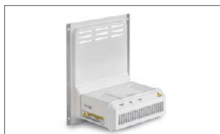
2 Draft shield rear panel with integrated ionisor, which can be fitted in place of the existing glass rear panel of the draft shield