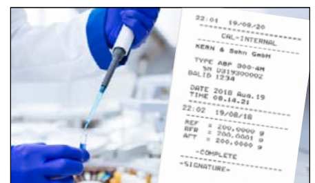
GLP/ISO record keeping, professional, detailed GLP Protocol, so that the balance is completely compliant with the relevant standard requirements in accordance with ISO, GLP and GMP