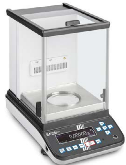
2 KERN ABP 100-5DM with optional ionisor

Premium analytical balance with the latest Single-Cell Generation for extremely rapid, stable weighing results - now also as a version with automatic sliding doors